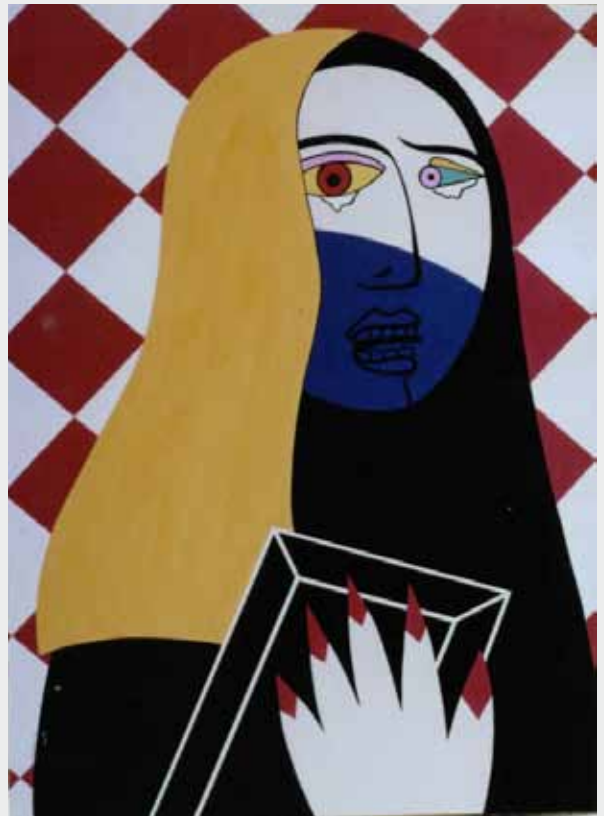
Weeping Women, Series # 1 , gouache on board, 15 x 20"

Helen Zughaib is a Lebanese-American painter living and painting in Washington, DC. Her work is included in the collections of the Library of Congress, the Arab-American National Museum, the World Bank, and the White House. Email: Hzughaib@aol.com