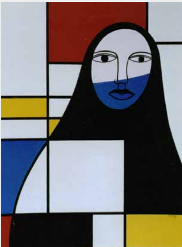
Abaya Series #2 , gouache on board, 15 x 20"

the negative stereotypes with a sense of humor and strength rather than the sense of confinement as seen by much of the West.