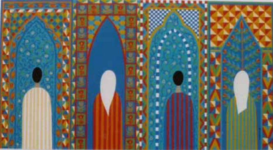
Prayers for the People , gouache on board, 18 x 25"

the negative stereotypes with a sense of humor and strength rather than the sense of confinement as seen by much of the West.