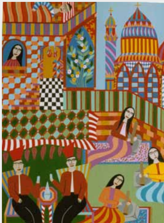
Making Kibbeh on Sunday Morning , gouache on board, 15 x 20"

As the war dragged on, the negative portrayal of Arabs in the media also continued. This distorted image of the Arabs led me to create a new series of work I called "Changing Perceptions". I chose to focus on the outward appearance of the women and specifically the wearing of the abaya . Here again, it seemed to me, that the negativity and misunderstanding which surrounded the abaya , was shocking. The abaya was portrayed as yet a further indication of oppression and subjugation of the female population, an anathema to most contemporary Western views of women. In "Changing Perceptions", I used images and elements of recognizable Western artists, Picasso, Mondrian, Lichtenstein, and combined them with the traditional black abaya to undermine and replace