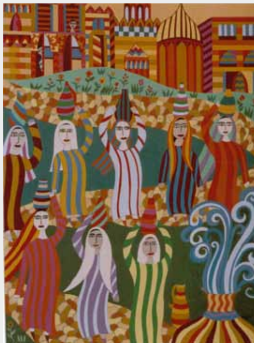
Walk to the Water Fountain, (Mishwar Al El-Ayn) , gouache on board, 15 x 20"