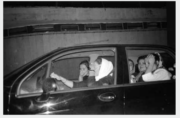
Image 2c. Shirin Aliabadi, Girls in Cars 3, 2005