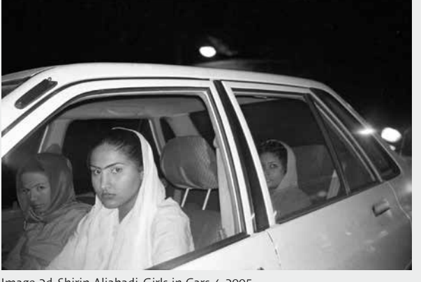
Image 2d. Shirin Aliabadi, Girls in Cars 4, 2005 Image courtesy of the artist and Third Line Gallery.