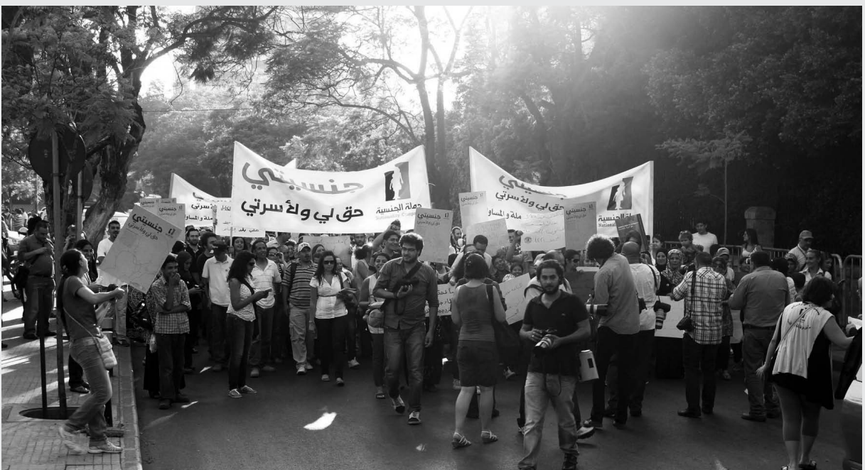
Captions from the CRTD.A Nationality Campaign. For further information contact CRTD.A at info@crtdd.org.lb