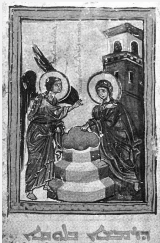
The annunciation of Mary in front of a spring, a Syriac manuscript that dates back to the 13th century, Midyat Archbishopric, Turkey.

‘The Annunciation Scene’ takes on a pure Islamic character in a miniature ornament found in an embellished copy of Masnavi by Jalal al-Dinn al-Rumi in 1598 (unknown artist). It is preserved at the Golestan palace in Teheran. In his drawing, the artist faithfully follows the Safavid school which marks the peak of Persian art of the book in its last golden age. Again, the picture unifies the outdoor and indoor scenes balancing between the two, based on complete and equal structure. Inside, Mary is sitting on a rug, and there is a halo surrounding her head which represents the fire of prophecy according to the Islamic artistic tradition. Gabriel is speaking to Mary from the outside while raising his arms. Mary herself is in a decorated house with a