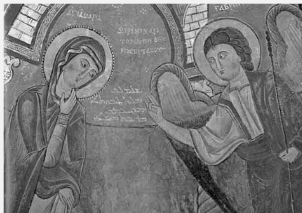
The annunciation of Mary, a mosaic that dates back to the 13th century, the Syriac monastery, Al-Natrun valley, Egypt.

dark blue dome adorned with golden engravings. It is located inside an exceptionally beautiful garden where three leafy trees add to the “Eden” effect. Master Jalal al-Din al-Rumi (1997) relates the story of “the Holy Spirit appearing to Mary in a human form” and saying: “I am the messenger of truth to you. Don’t be afraid and do not hide from me for this is the command”. Al-Rumi (1997) continues the story in a most creative poetic manner: