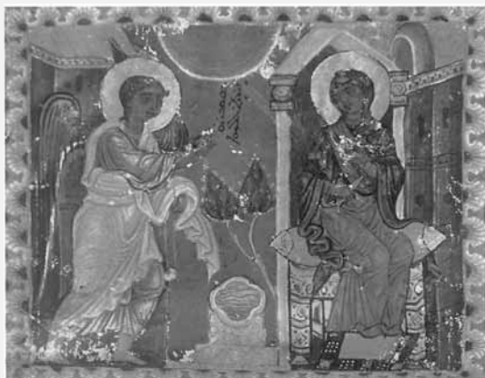
The annunciation of Mary, a Syriac manuscript that dates back to the 13th century, Al-Zaafaran Monastery, Turkey.