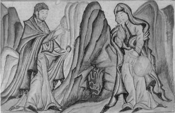
The annunciation of Mary in front of Gabriel, Jami' al-Tawarikh , 1314, University of Edinburgh library.

James. According to this version, Mary was brought to the temple as a child and stayed there until she was 12 years old. She was one of seven virgins commissioned by the priest to weave a curtain for the Temple. The story goes on to say that it was by lot-casting that Mary was given the true purple and the scarlet, "... but Mary took the scarlet and began to spin it" (The Apocryphal New Testament, 1924, p. 45). Artistically speaking, this miniature seems unique with its Chinese style, and we find nothing among Eastern Christian books similar to this style. The Syriacs reached China before Western missionaries and they brought the gospel to its remote areas in the medieval centuries. However, the art we received from this spiritual adventure was no more than a few miniatures. "Al-Athar al-Baqiya" miniature was most likely inspired by other extinct miniatures. The special attribute of this miniature stands out when compared to a Coptic miniature from the 13th century depicting Mary sitting on the floor holding a spindle. This ornament appears to have an Abbasid style, despite its overall Byzantine feature. By contrast, 'The Entry Holiday' miniature seems Asian in character, regardless of its Islamic identity which is linguistically Arabic and geographically Persian.