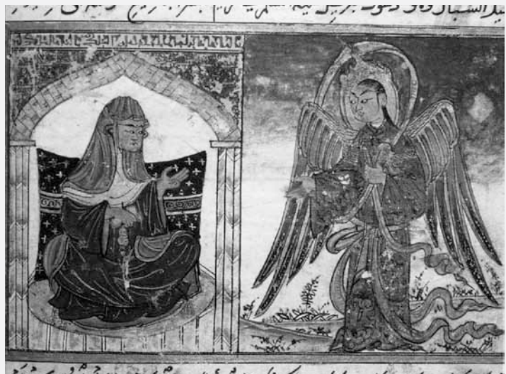
The annunciation of Mary fil Mehrab, miniature from Al-Biruni’s Al-Athar al-Baqiya ‘an al-Qurun al-Khaliyyah , 1307, University of Edinburgh library.

‘The Entry Holiday’, which marks Gabriel’s coming to Mary with the good news of the birth