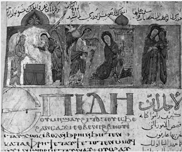
The annunciation of Mary, a Coptic manuscript that dates back to mid 13th century, Library of the Catholic Institute, Paris.

out of water and rushed to a cavern where she was met by Gabriel, whom God sent “in the form of a man”. So he brought her the good news of a male offspring then “he blew in her pocket and his breath reached the womb and Jesus was conceived” (Al-Tabari, 1967, p. 593).