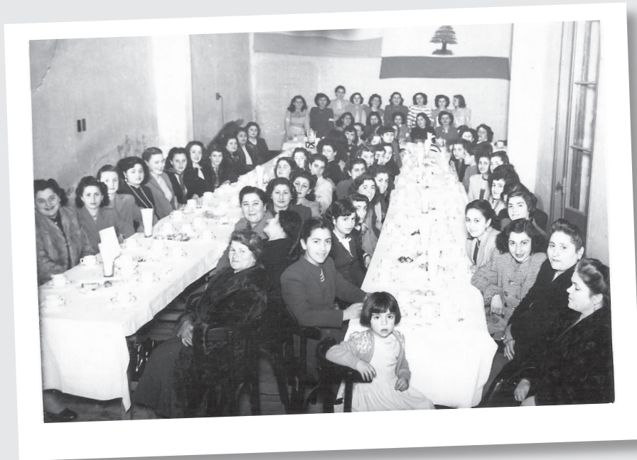
Meeting of Lebanese women, end of 1940's

Lebanese women counted on the courage born of having left their native Lebanon and of having to forge a shield to protect them from the pain of exile. Undoubtedly their actions contributed to the achievements that women enjoy today in Argentina. They realized how to open paths and unify their efforts to further the cause of their sex: "The Lebanese woman is a perfect mixture between the strong cedar that grows despite adversity and the water of the Mediterranean that molds to the winds that blow at its shores" (Daher, 2010).