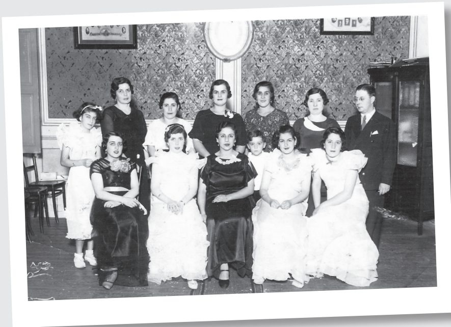
Lebanese women in the Sociedad Libanesa de Rosario, 1928

needs of each province, and a Supreme Council that coordinates activities of the working groups in the service of the nation”. 1