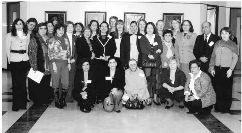
The conference participants