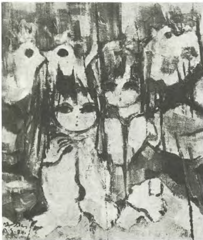
4. Asma Fayoumi (SYRIA) 5. Shalabia Ibrahim (SYRIA)