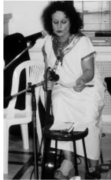
Evelyne Accad singing